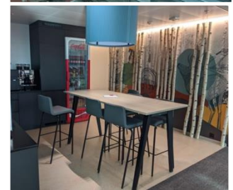
Image Caption 1. Our beautiful offices at Prime Tower in Zurich.