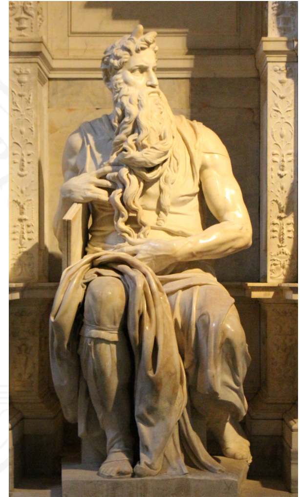
Michelangelo's Moses (San Pietro in Vincoli, Rome) Moses holds the Ten Commandments in his hand: written in natural language