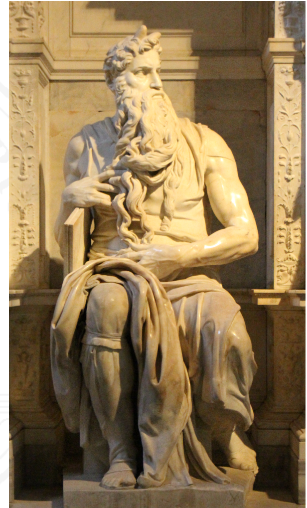
Michelangelo's Moses (San Pietro in Vincoli, Rome) Moses holds the Ten Commandments in his hand: written in natural language