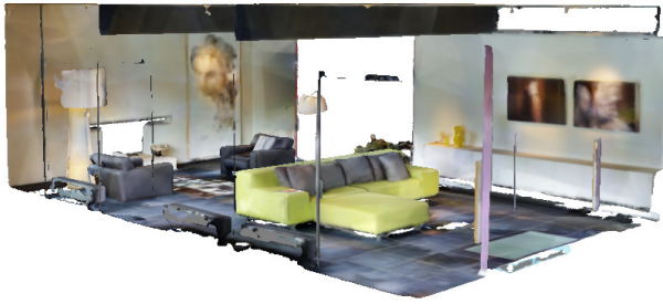
Input PTX point cloud