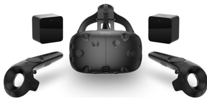
Figure 1: HTC Vive.

Many human-computer interaction techniques using input devices like keyboard and mouse have been developed and matured over time. For example, software tools use well-known methods for scrolling, zooming, panning, and selecting with a mouse in 2D environments in identical ways. In comparison, the input devices in Virtual Reality (VR) environments are new.