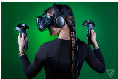
Figure 2: HTC Vive interaction.

Tracking the head and two hand-held controllers, each with six degrees of freedom provides a considerable input space. Creative interaction techniques should be devised, tested, and improved iteratively